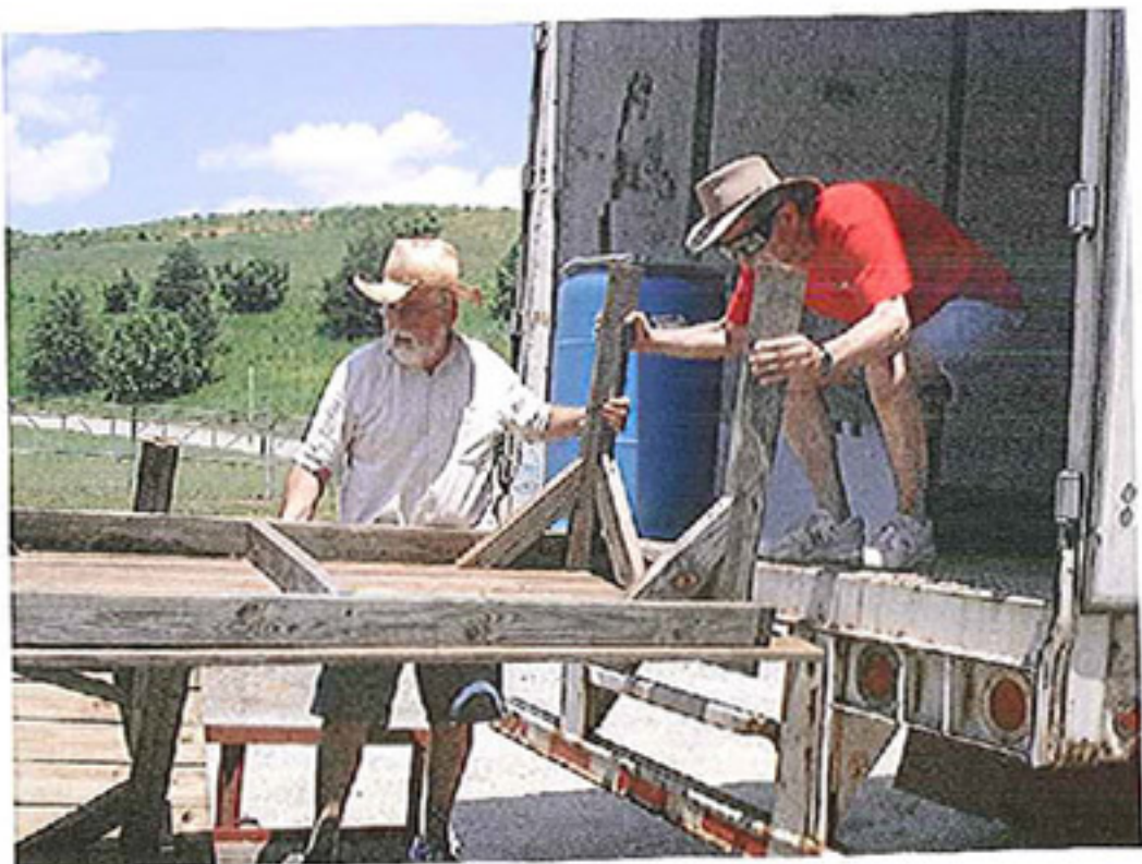
Making the move from the old field.