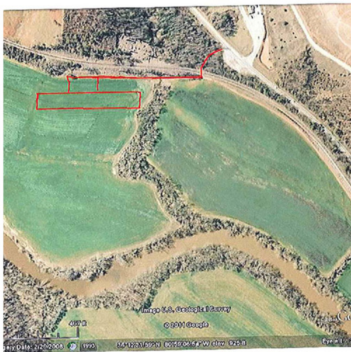
Google map image showing where Flying Field was to be located.