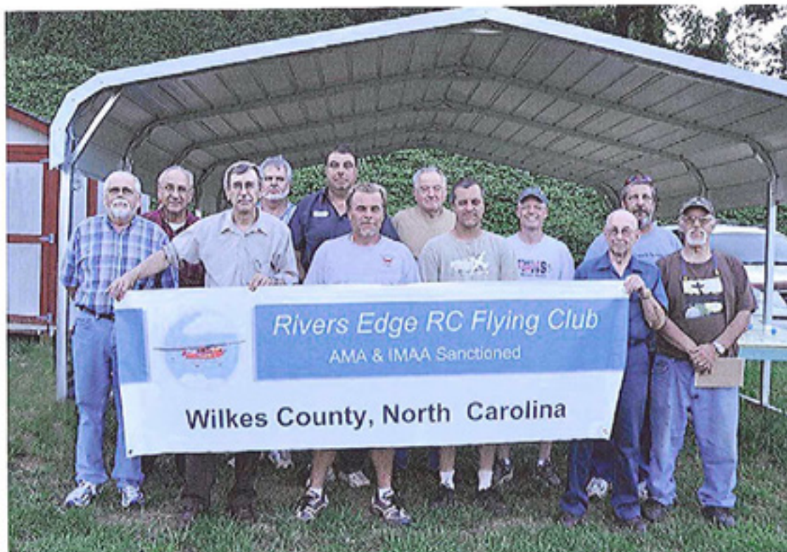
A small group of members at a meeting wanted a photo for our webpage and facebook.