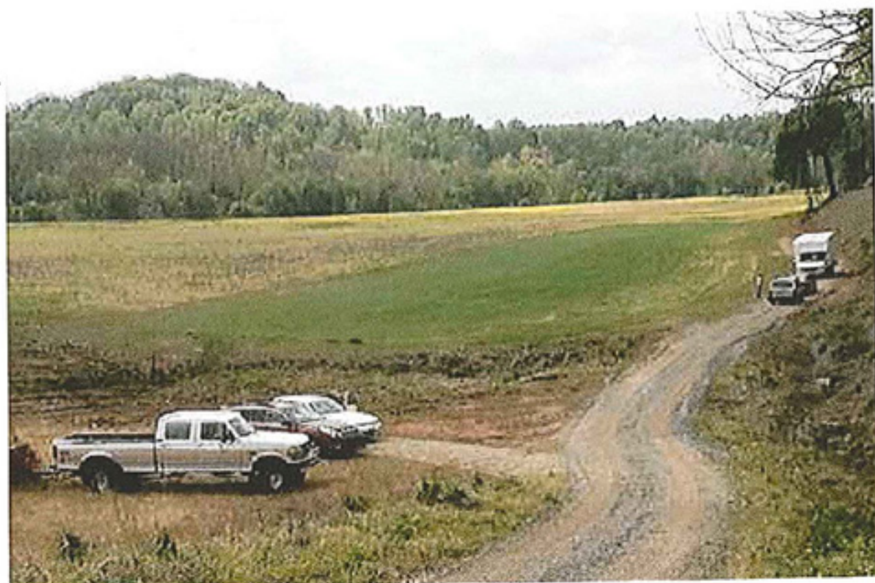
Grass has come up!