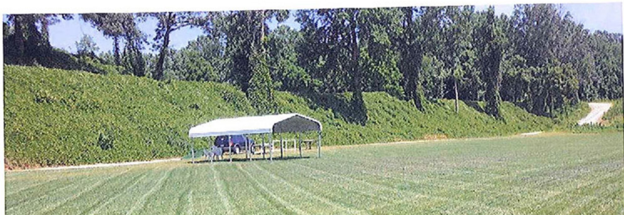
Grass really looked good after the rains.