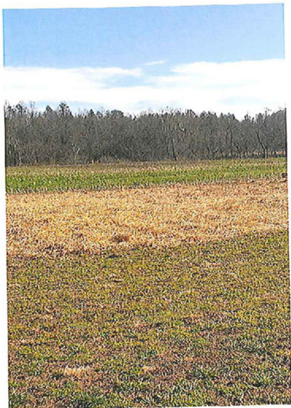
The field has been widened.