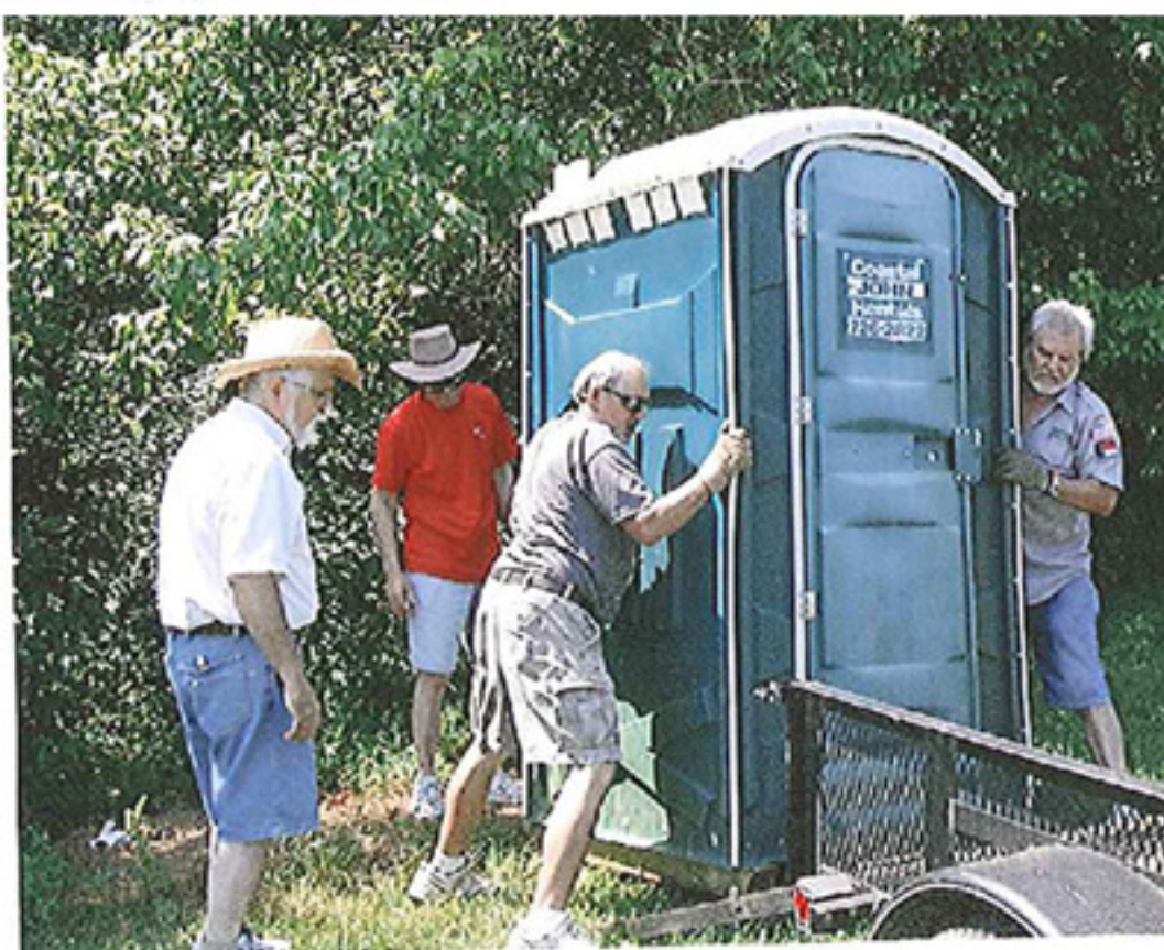
More of the move from the old field.