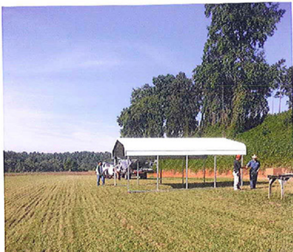
New shed is installed.