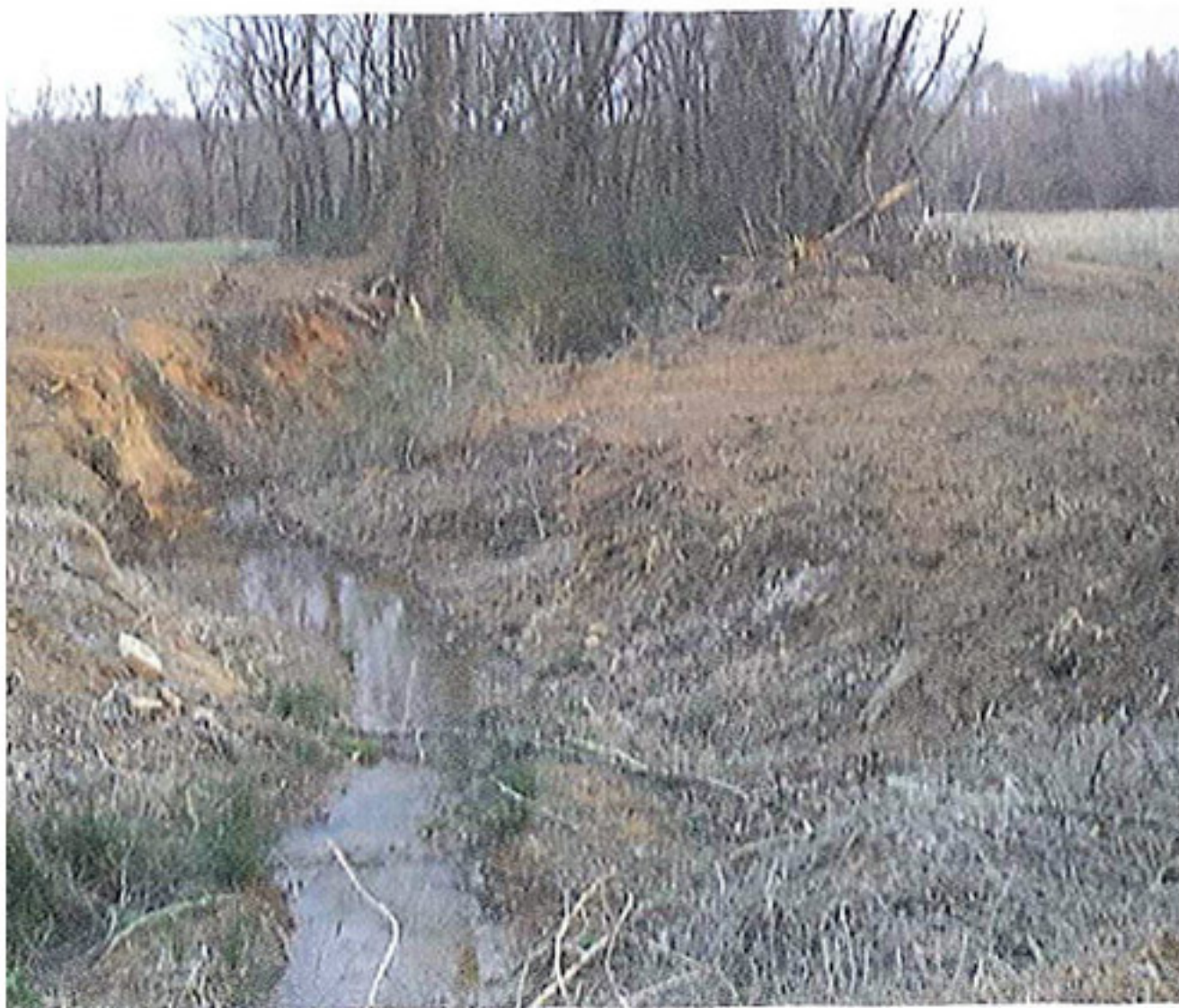
Ditch where culvert was used.