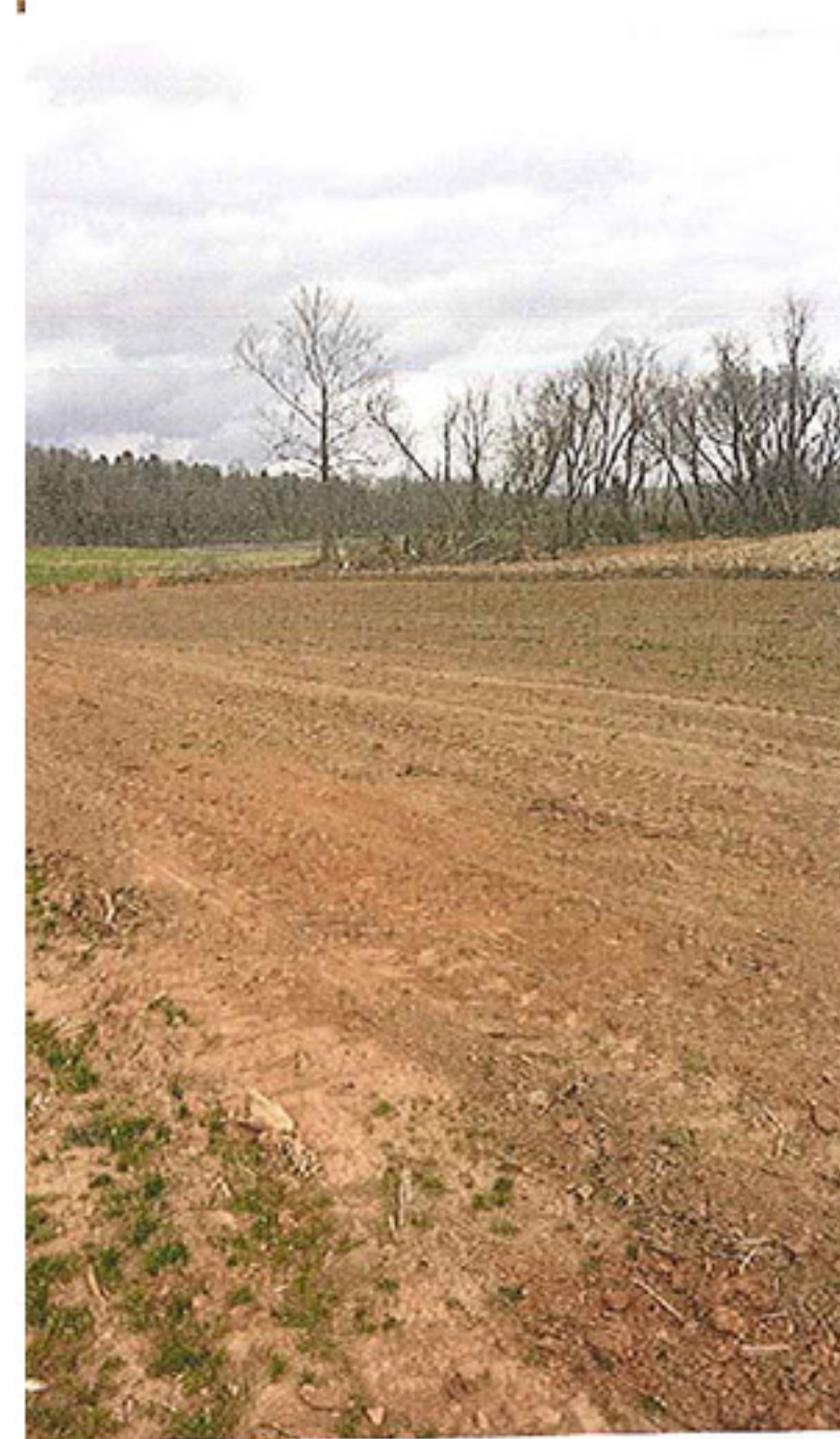
After initial grading.